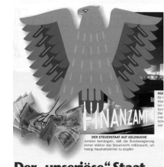
Der "unseriöse" Staat